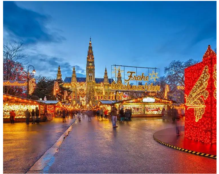
Vienna's largest Christmas Market. (B,L,D)

bike ride along the Danube. During the afternoon, visit the market at Schönbrunn Palace with a giant sparkling Christmas tree. Cap the day off with "Vienna by Night" Christmas Markets at the beautifully decorated Maria Theresaplatz Christmas Market, set amongst the worldrenowned sights of Vienna's majestic Ringstrasse, and at the illuminated Rathaus,