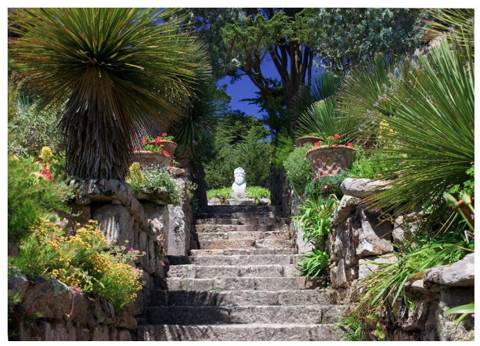
the Priory ruins. He had three terraces carved from the rocky south slope and maximized Tresco's mild Gulf Stream climate. Even in mid-winter there still are hundreds of plants flowering here.

For many visitors Tresco is the most attractive of the Isles of Scilly. This is especially due to its Abbey Garden, which is home to thousands of exotic plant species from around 80 different countries. Plant collector Augustus Smith began the gardens in the 1830s on the site of an old Benedictine Abbey by channeling the weather up and over a network of walled enclosures built around