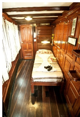
Single - Blue -