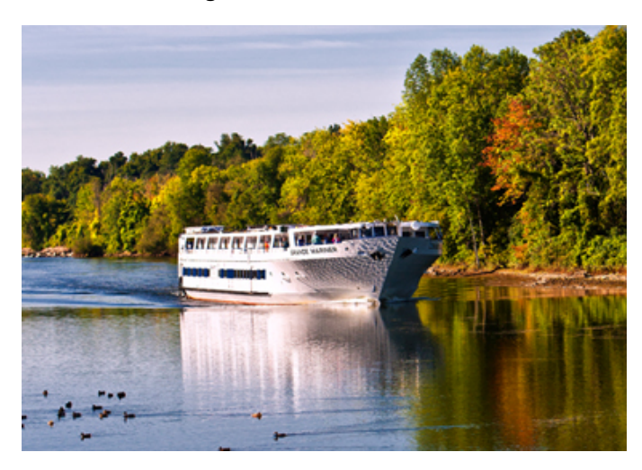
DAY 3 - Cruise the Erie Canal

This morning in Kingston, NY, treat yourself to an optional tour of nearby Hyde Park and Springwood, the beloved estate of President Franklin D. Roosevelt. We'll follow the Hudson River through the Erie Canal, a testament to American ingenuity, and into the Oswego Canal. Watch as the ship's unique retractable pilot house is lowered, allowing the vessel to slip easily beneath low bridges.