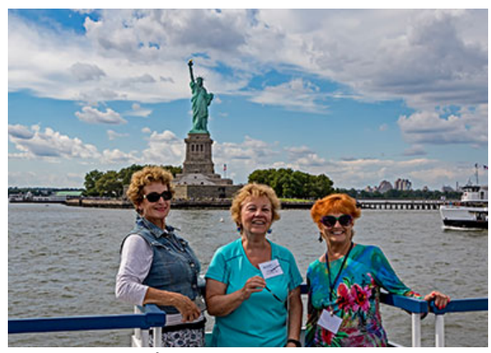
DAY 1 - New York, NY

From the bustling bright lights of Manhattan to the treasure of Quebec City, travel the waterways which blend the cultures of the US and Canada. This journey introduces you to both amazing civil engineering feats such as the Erie Canal and stunning natural wonders like the 1000 Islands region. A tour of New York Harbor puts you in a NY state of mind before setting sail on the Hudson River.