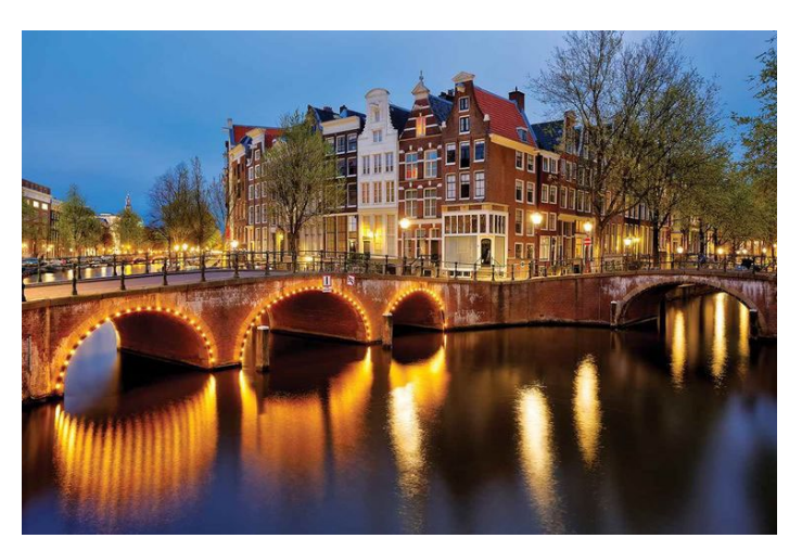
DAY 8 AMSTERDAM - DISEMBARKATION Bid Farewell to Amsterdam and prepare for your flight home. (B)

View Amsterdam on a scenic canal cruise followed by a walk to Begijnhof, known for its Middle Age buildings. Or taste the local flavor on a guided walk past the city's iconic canals, gabled houses, narrow bridges and house boats, tasting Dutch specialties at a grand Amsterdam cafe. (B,L,D)