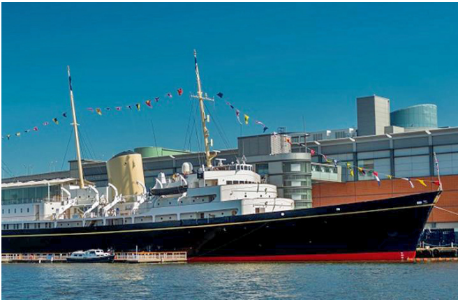
Royal Yacht Britannia