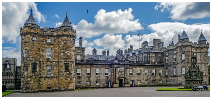
Palace of Holyroodhouse

Next stop is magnificent St Giles Cathedral . For the better part of a thousand years St Giles’ has been at the physical and spiritual heart of Scotland’s