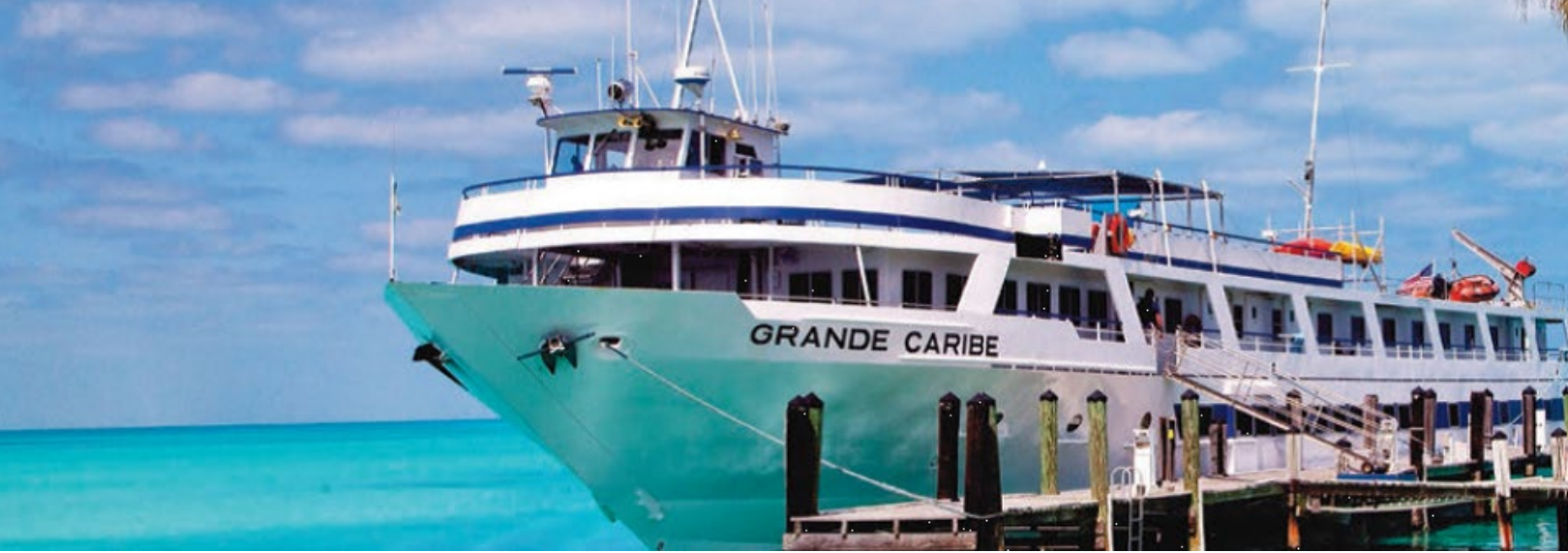
GRANDE CARIBE DECK PLAN