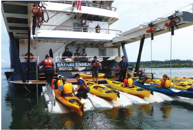
Easy kayak boarding - means everyone can do it!