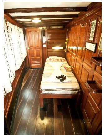
Single - Blue - Cabin