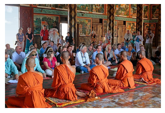
Day 10 - KAMPONG CHAM - SIEM REAP - DISEMBARKA-TION. Disembark in Kampong Cham and transfer by motor-coach to Siem Reap, gateway to the Angkor Archaeological Park, a UNESCO World Heritage Site and the former capital of the Khmer empire. You'll visit nearby Ta Prohm, known as the "Kingdom of the Trees," for the way in which the temple stones have become intertwined with thick forest vegetation. (B,D)

Khmer legend, the twin mountains were formed as the result of a competition between the men and women of an ancient Cambodian kingdom to resolve which gender would be responsible for wedding proposals. Cap the day off with a festive Farewell Dinner on board. (B,L,D)