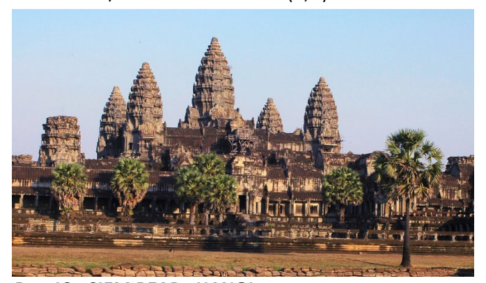
Day 12 - SIEM REAP - HANOI

Begin your morning exploration of the temple complex at Angkor Wat, the most iconic of all Angkorian temples, built by King Suryavarman II in the early 12th century to honor the Hindu god, Vishnu. An afternoon excursion takes you to see the fascinating jewel in the crown of Angkorian art, Banteay Srei, which means "Citadel of Women," as it has been said that the carving is too fine to have been done by the hand of man. During the evening, be treated to a special "Apsara Dancing Show" at your hotel, featuring local Cambodian/Khmer folk dancers. (B,D)