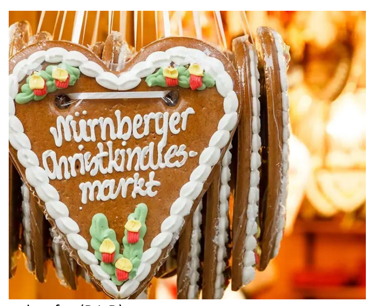
and crafts. (B,L,D)

and the Porta Praetoria, before visiting the Old Town Christmas Market. As an alternate option, sample some of Bavaria's specialties—beer, sausage and pretzels. Or bike to the base of Walhalla where there is a neoclassical white marble temple inspired by the Parthenon in Athens. Later in the day, you'll be treated to one of Bavaria's most beautiful and romantic Christmas Markets at Thurn and Taxis, where you can watch artisans make their unique arts