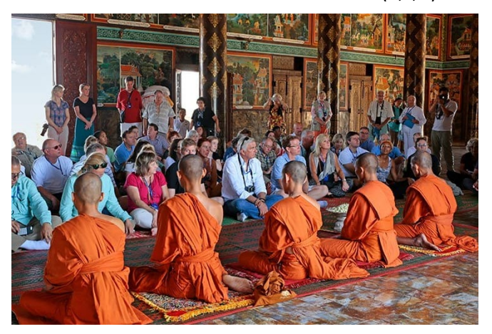
Day 10 - KAMPONG CHAM - SIEM REAP - DISEMBARKA-TION. Disembark in Kampong Cham and transfer by motor-coach to Siem Reap, gateway to the Angkor Archaeological Park, a UNESCO World Heritage Site and the former capital of the Khmer empire. You'll visit nearby Ta Prohm, known as the "Kingdom of the Trees," for the way in which the temple stones have become intertwined with thick forest vegetation. (B,D)

Phnom Srei (male and female mountains). In the annals of Khmer legend, the twin mountains were formed as the result of a competition between the men and women of an ancient Cambodian kingdom to resolve which gender would be responsible for wedding proposals. Cap the day off with a festive Farewell Dinner on board. (B,L,D)