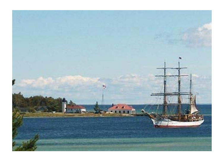
DAY 4 - Mackinac Island, Lovely Mackinac Island embodies the grace of the Victorian era with beautifully preserved historic homes and horsedrawn carriages — its only form of transportation! An optional carriage tour of the island includes entrance to the Wings of Mackinac Butterfly Conservatory and Surrey Hill Square Carriage

The largest island on Lake Michigan, Beaver Island boasts a rich history of Native American, French, and Irish cultures, and was the epicenter of the region's freshwater fishing industry in the 19th century. Enjoy an afternoon of relaxation, or explore the island's scenic beaches, majestic state forest, the well-loved island Toy Museum or Old Mormon print shop.