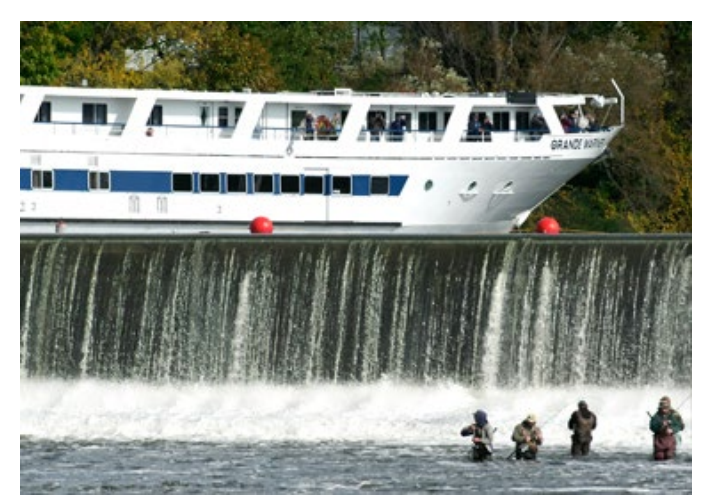
Day 8 – Cruise the Thousand Islands

Antique Boat Museum for a glimpse of the world's largest showcase of classic recreational boats. Spend the night in beautiful Alexandria Bay, NY with views of the famed Boldt Castle.