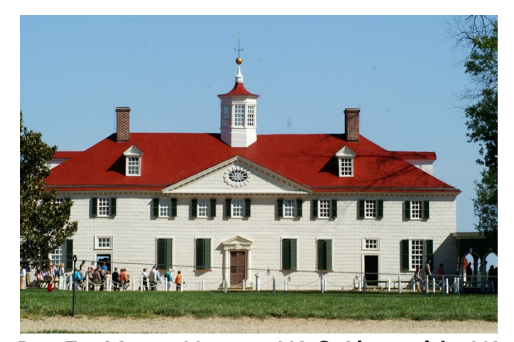
Day 7 – Mount Vernon, VA & Alexandria, VA

town offering boutique shopping. You may opt to tour Colonial Williamsburg, the world's largest living history museum.